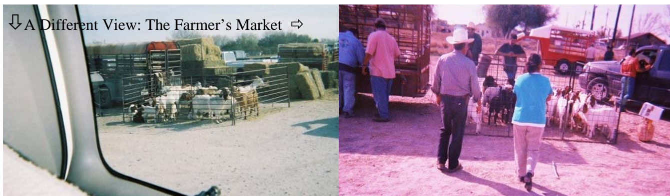
↘ A Different View: The Farmer's Market ⇨

TAMU MS 4351 Blocker Room 512 College Station, TX 77843-4351 Tel: 979-845-3157, Fax: 979845-3090, E-mail: malrc@tamu.edu